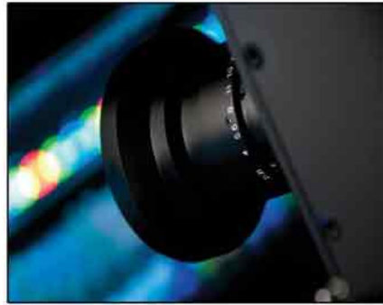
New high resolution full color cameras