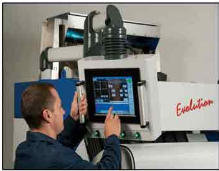
User friendly, multilingual touch screen for easy set up and operation